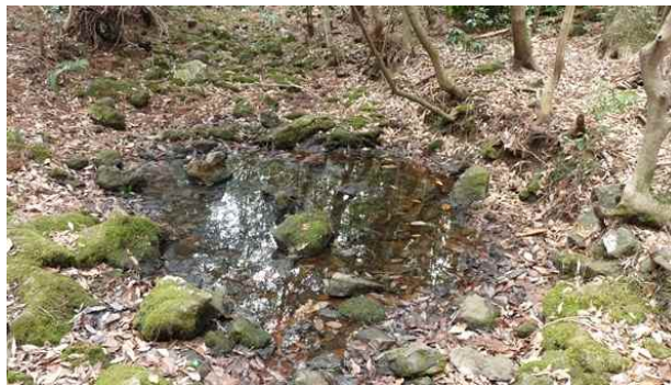
Fig. 1. The whole view of survey area.

Hannam research experimental forest ranging from an altitude of 320 m to 780 m is located in Hannam-ri, Namwon-eup of the city of Seogwipo and has an area of 1,203 ha. This survey was conducted at the stagnant pool of the small valley located within forest (Fig. 1).