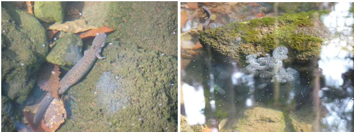
Fig. 2. A female of Hynobius quepartensis (left) and eggs attached on the rock (right).

The first spawning day of Hynobius quepartensis was 27 January, 2008, 2 February, 2009, 23 January, 2010, 26 February, 2011, 6 February, 2012, 7 January, 2013 (Fig. 2). The weather condition during 11 days including first spawning day revealed that daily mean temperature was more than 5 degrees, which was lasted up to seven days and daily maximum temperature including the first spawning day was more than 5 degrees as well. Accumulated precipitation was more than 20mm during 11 days (Table 1, Fig. 3).